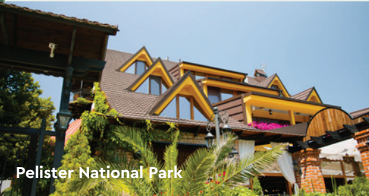
Pelister National Park