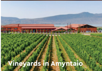
Vineyards in Amyntaio