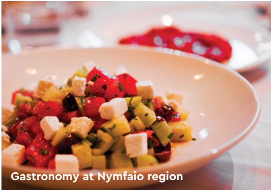
Gastronomy at Nymfaio region

Indulge in a gastronomic adventure across Florina, Nymfaio, and Prespes! Discover the rich culinary traditions highlighting the region's agricultural products and authentic flavours. In Florina, savour the delectable taste of Florina's peppers, renowned for their sweetness and versatility in spreads and dips. Don't miss the chance to try the acclaimed giant elephant beans (in Greek: gigantes), along with other local delights like feta cheese, and mouth-watering pastries. Satisfy your taste buds with an array of traditional dishes and local products, creating unforgettable memories in each culinary delight!