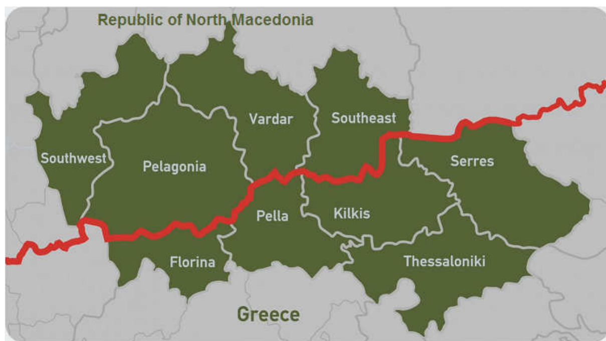
Figure 1: The Eligible Programme Area

Total population of the Programme area is 2,366,750 people. The total area covers 29,259 km 2 , 14,422 km 2 in Greece and 14,837 km 2 in the Republic of North Macedonia.