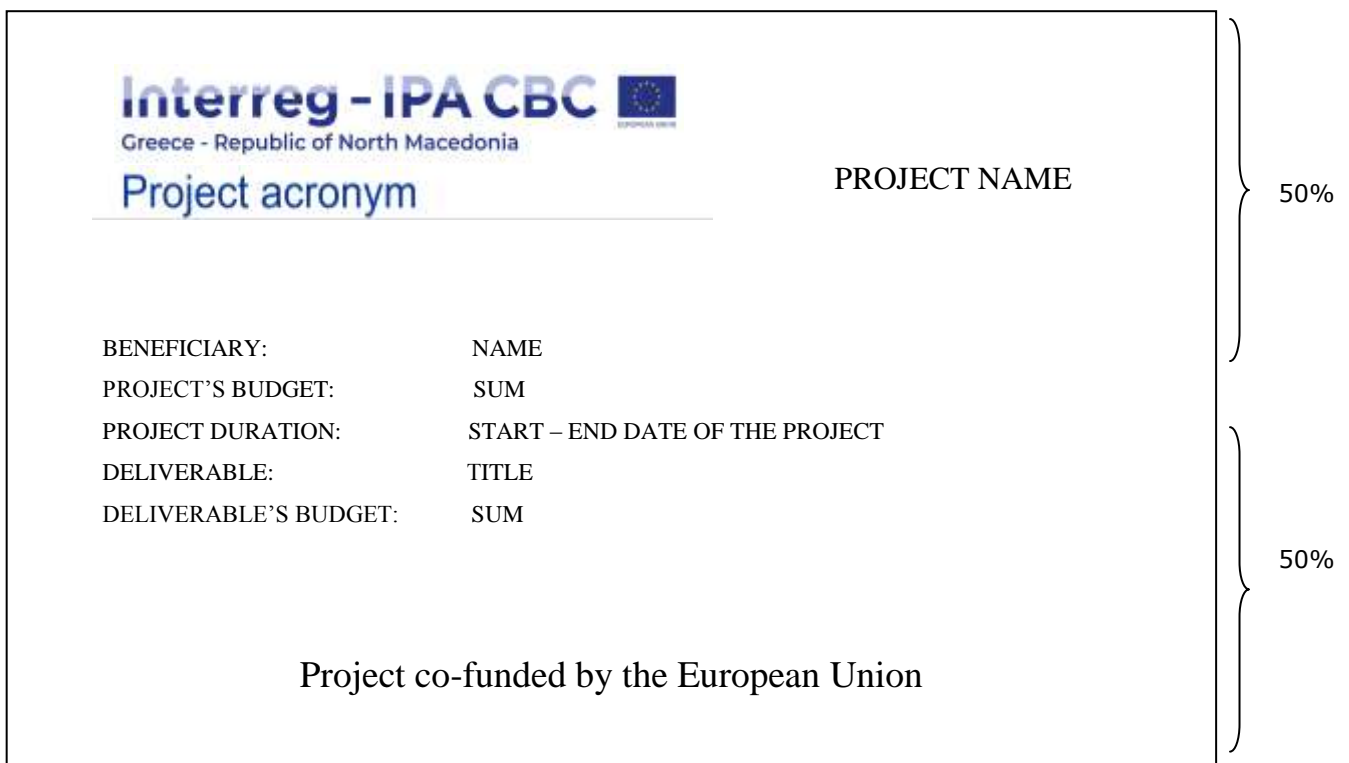
Picture 6: Information sign/ Billboard/Permanent Explanatory Plaque template