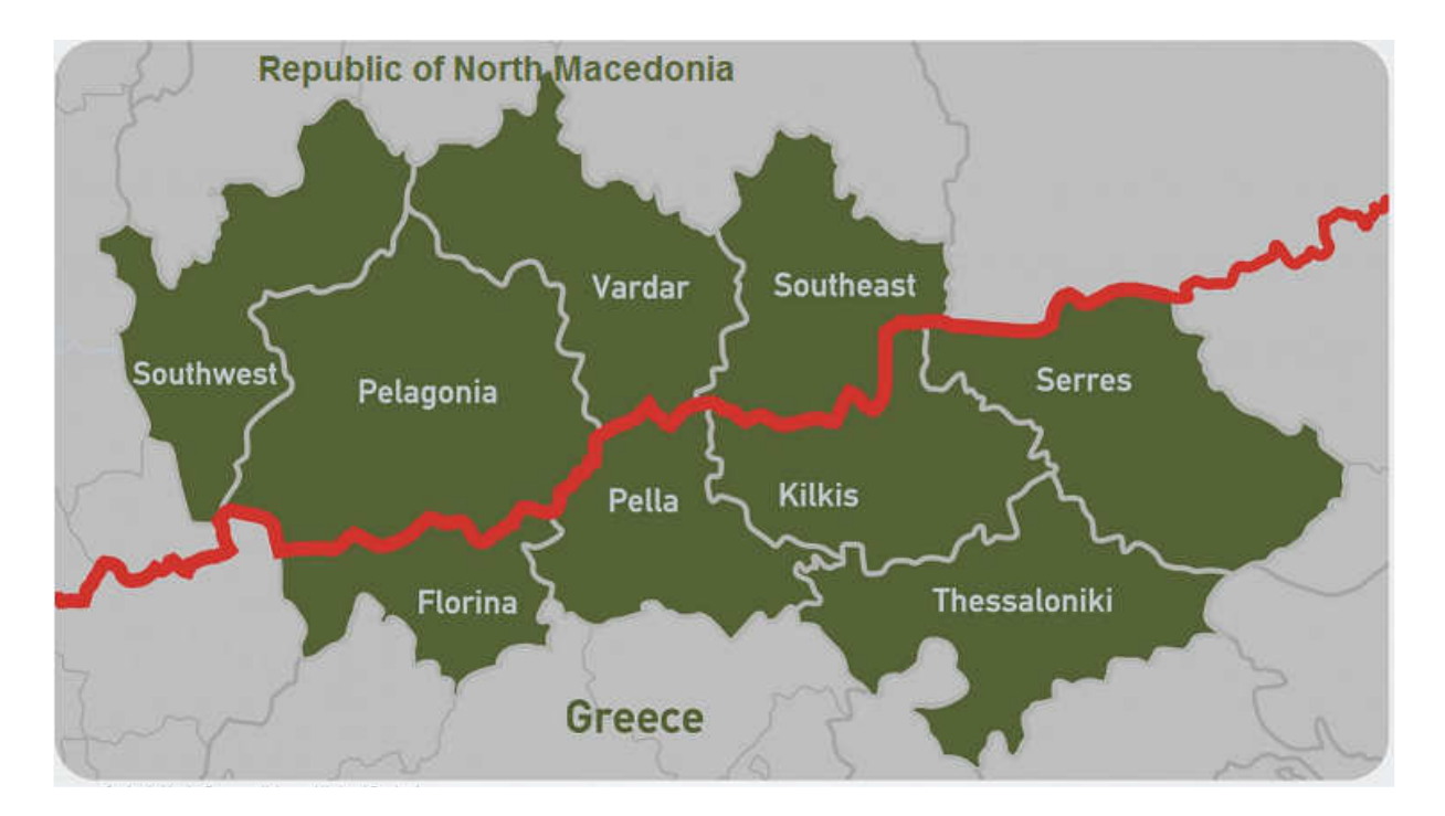
Figure 1: The Eligible Programme Area

Total population of the Programme area is 2,366,750 people. The total area covers 29,259 km2, 14,422 km2 in Greece and 14,837 km2 in the Republic of North Macedonia.